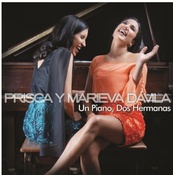
“Un piano, dos hermanas” (2014)